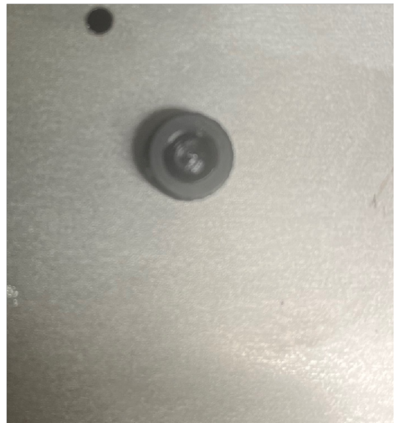
Figure 3: Retention Grommet