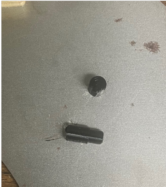
Figure 2: Alignment Peg